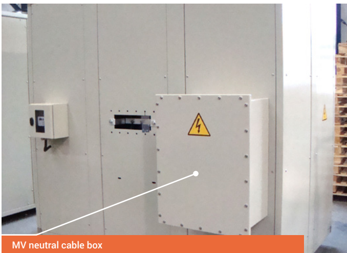
MV neutral cable box