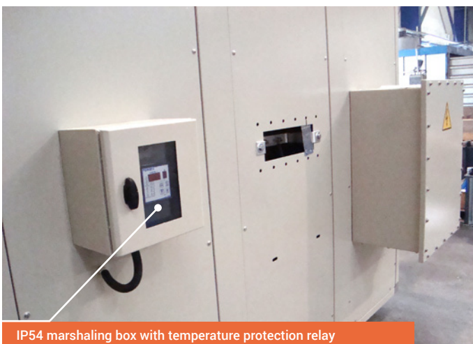
IP54 marshaling box with temperature protection relay