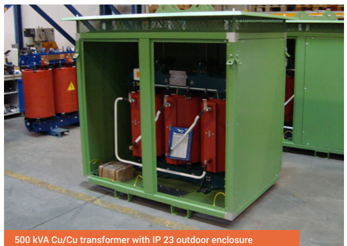
500 kVA Cu/Cu transformer with IP 23 outdoor enclosure