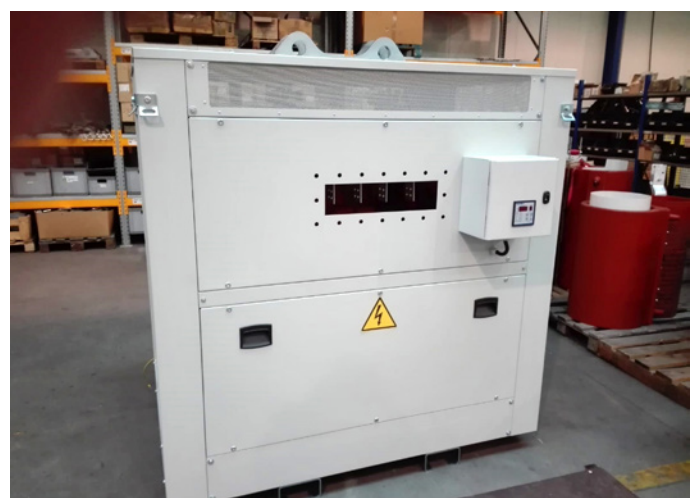
■ 800 kVA transformer in IP 21 indoor enclosure according UK design (IP 23 marshalling box, cut-out for additional equipment). Installation place: UK