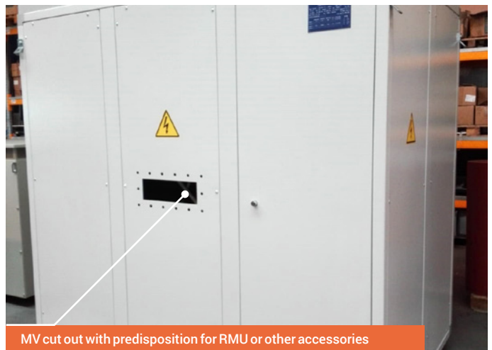
MV cut out with predisposition for RMU or other accessories