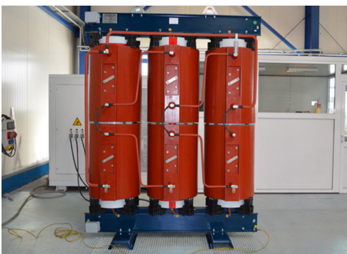
■ 1600 kVA-insulation class 36 kV-12-Pulse converter transformer manufactured for power supply of large generator in order to guarantee significant reduction of the harmonic distortion, generated on the power line. Installation place: Germany

We offer a wide range of customised solutions to meet our customers' requirements, and we are always at our client's disposal to assist with technical challenges. See some of our special units below.