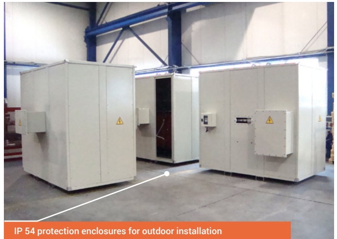
IP 54 protection enclosures for outdoor installation